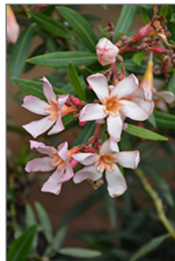
Sofia Oleander flowers

Sofia Oleander is recommended for the following landscape applications;