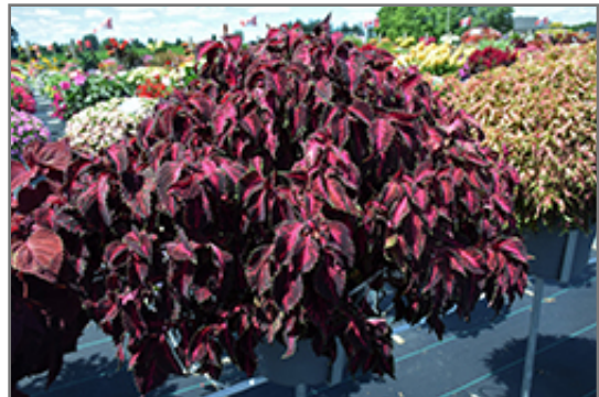
PartyTime Pink Fizz Coleus