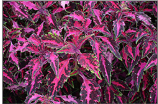
PartyTime Pink Fizz Coleus foliage

PartyTime Pink Fizz Coleus is recommended for the following landscape applications;