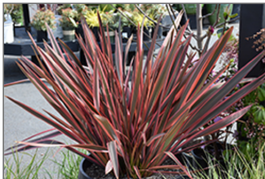
Rainbow Chief New Zealand Flax

This is a relatively low maintenance plant, and is best cleaned up in early spring before it resumes active growth for the season. Deer don't particularly care for this plant and will usually leave it alone in favor of tastier treats. It has no significant negative characteristics.