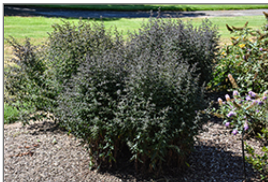
Prince Calico Aster