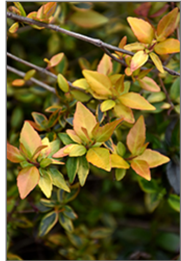
Gold Dust Abelia foliage

Gold Dust Abelia is recommended for the following landscape applications;