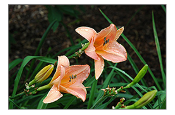
Orchard Sprite Daylily flowers