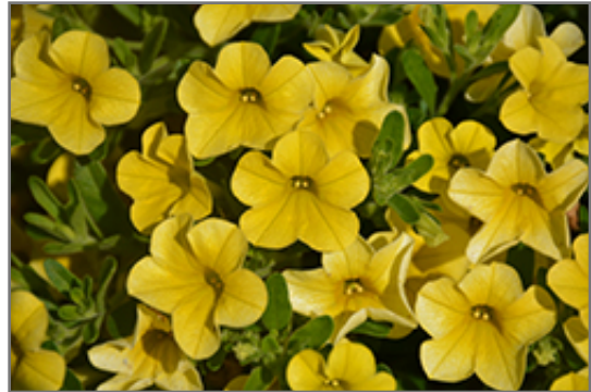
Catwalk Perfect Yellow Calibrachoa flowers

Catwalk Perfect Yellow Calibrachoa is recommended for the following landscape applications;