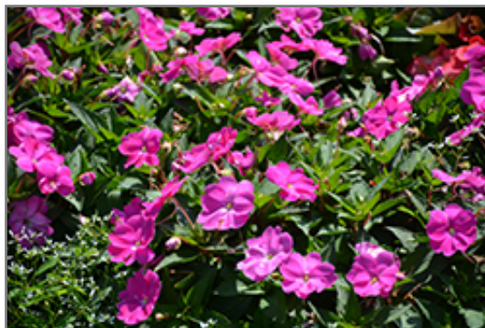
Infinity Lavender New Guinea Impatiens flowers

Infinity Lavender New Guinea Impatiens is a fine choice for the garden, but it is also a good selection for planting in outdoor containers and hanging baskets. It is often used as a 'filler' in the 'spiller-thriller-filler' container combination, providing a mass of flowers against which the thriller plants stand out. Note that when growing plants in outdoor containers and baskets, they may require more frequent waterings than they would in the yard or garden.