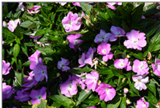
Infinity Lavender New Guinea Impatiens in bloom