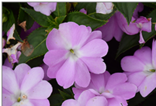
Infinity Lavender New Guinea Impatiens flowers

This plant will require occasional maintenance and upkeep, and should not require much pruning, except when necessary, such as to remove dieback. It has no significant negative characteristics.