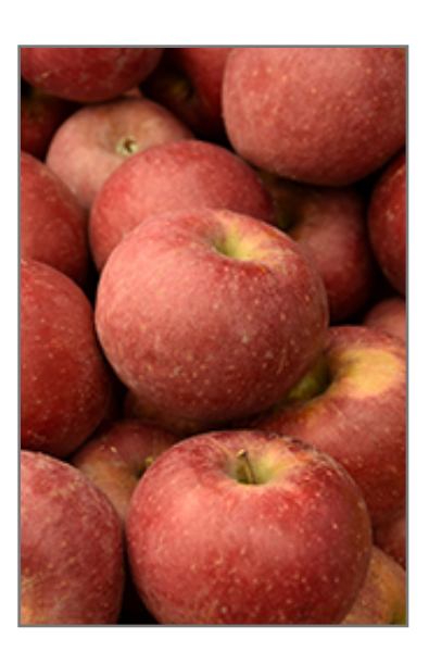
Winesap Apple fruit

This is a deciduous tree with a more or less rounded form. Its average texture blends into the landscape, but can be balanced by one or two finer or coarser trees or shrubs for an effective composition. This is a high maintenance plant that will require regular care and upkeep, and is best pruned in late winter once the threat of extreme cold has passed. Gardeners should be aware of the following characteristic(s) that may warrant special consideration;