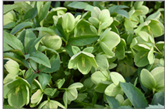
Ice Breaker Max Hellebore flowers