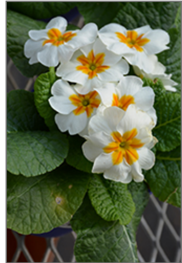
Winter White Primrose flowers

When grown indoors, Winter White Primrose can be expected to grow to be only 4 inches tall at maturity extending to 8 inches tall with the flowers, with a spread of 9 inches. It grows at a fast rate, and under ideal conditions can be expected to live for approximately 5 years. This houseplant performs well in both bright or indirect sunlight and strong artificial light, and can therefore be situated in almost any well-lit room or location. It requires an evenly moist well-drained soil for optimal growth, but will suffer if left to grow in standing water. The surface of the soil shouldn't be allowed to dry out completely, and so you should expect to water this plant once and possibly even twice each week. Be aware that your particular watering schedule may vary depending on its location in the room, the pot size, plant size and other conditions; if in doubt, ask one of our experts in the store for advice. It is not particular as to soil type or pH; an average potting soil should work just fine.