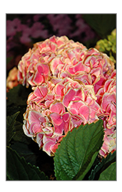
Edgy Hearts Hydrangea flowers

When grown indoors, Edgy Hearts Hydrangea can be expected to grow to be about 4 feet tall at maturity, with a spread of 4 feet. It grows at a fast rate, and under ideal conditions can be expected to live for approximately 20 years. This houseplant should be situated in a location that that gets indirect sunlight at most, although it will usually require a more brightly-lit environment than what artificial indoor lighting alone can provide. It requires an evenly moist well-drained soil for optimal growth. The surface of the soil shouldn't be allowed to dry out completely, and so you should expect to water this plant once and possibly even twice each week. Be aware that your particular watering schedule may vary depending on its location in the room, the pot size, plant size and other conditions; if in doubt, ask one of our experts in the store for advice. It is not particular as to soil type, but has a definite preference for acidic soil. Contact the store for specific recommendations on pre-mixed potting soil for this plant.