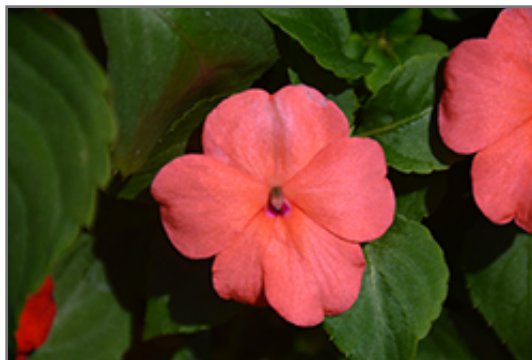
Lollipop Peach Salmon Impatiens flowers