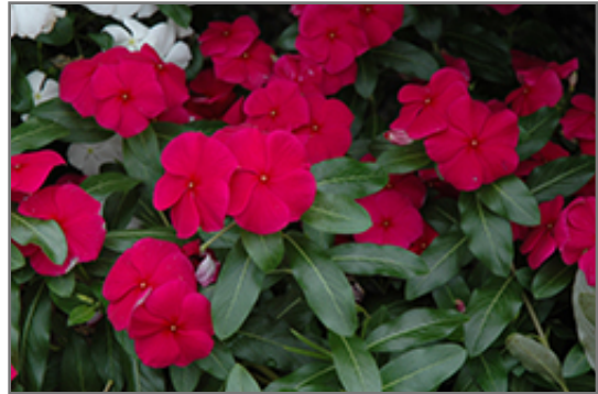
Valiant Burgundy Vinca flowers

This plant will require occasional maintenance and upkeep, and should not require much pruning, except when necessary, such as to remove dieback. It is a good choice for attracting butterflies to your yard, but is not particularly attractive to deer who tend to leave it alone in favor of tastier treats. It has no significant negative characteristics.