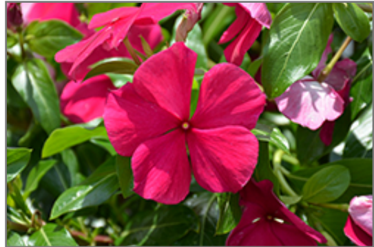
Valiant Burgundy Vinca flowers

Valiant Burgundy Vinca is a fine choice for the garden, but it is also a good selection for planting in outdoor containers and hanging baskets. Because of its trailing habit of growth, it is ideally suited for use as a 'spiller' in the 'spiller-thriller-filler' container combination; plant it near the edges where it can spill gracefully over the pot. Note that when growing plants in outdoor containers and baskets, they may require more frequent waterings than they would in the yard or garden.