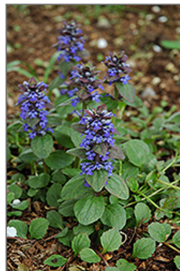
Caitlin's Giant Bugleweed flowers

Caitlin's Giant Bugleweed is recommended for the following landscape applications;