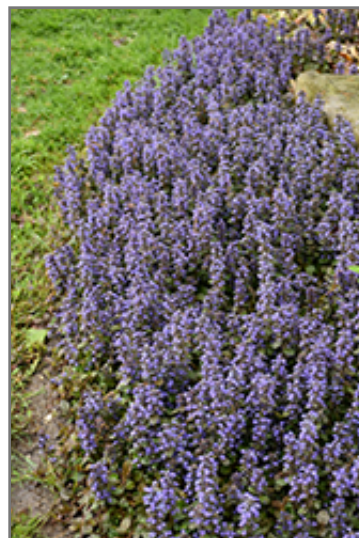
Caitlin's Giant Bugleweed