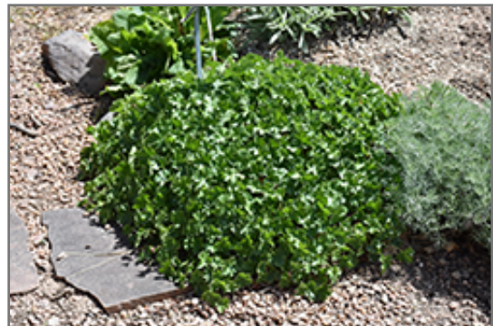
Sandia Coral Bells