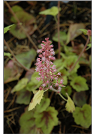
Hot Spot Foamy Bells flowers

A striking variety with bright lime-green leaves with contrasting dark red spots radiating from the leaf centers; dainty pink bell flowers in late spring and through summer; a vigorous grower that forms a dense mound