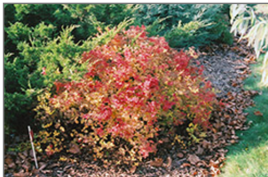
Golden Princess Spirea in fall