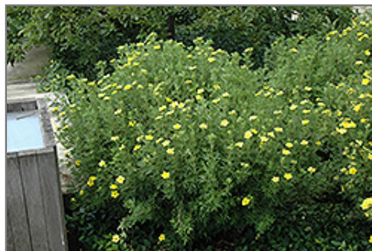
Fredheim Potentilla in bloom