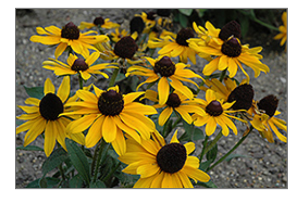
Corona Coneflower flowers