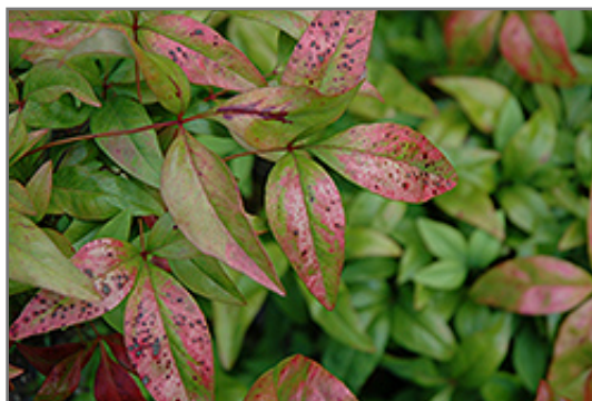
Okame Nandina foliage