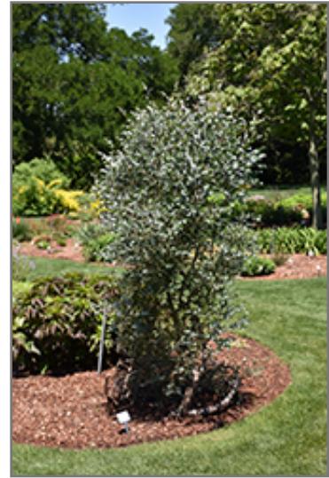
Silver Drop Cider Gum

Silver Drop Cider Gum makes a fine choice for the outdoor landscape, but it is also well-suited for use in outdoor pots and containers. With its upright habit of growth, it is best suited for use as a 'thriller' in the 'spiller-thriller-filler' container combination; plant it near the center of the pot, surrounded by smaller plants and those that spill over the edges. It is even sizeable enough that it can be grown alone in a suitable container. Note that when grown in a container, it may not perform exactly as indicated on the tag - this is to be expected. Also note that when growing plants in outdoor containers and baskets, they may require more frequent waterings than they would in the yard or garden.