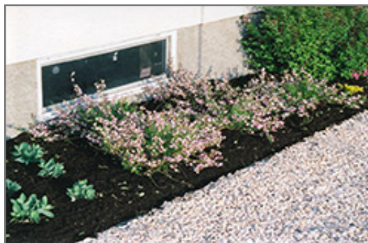
Purple Broom in bloom