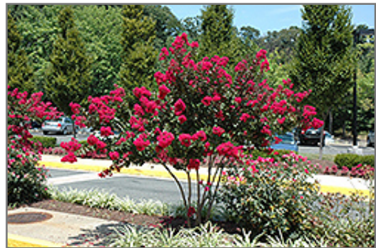
Cedar Lane Red Crapemyrtle in bloom