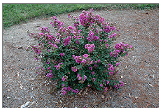
Early Bird Purple Crapemyrtle in bloom