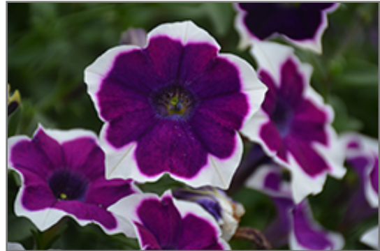
Cascadias Rim Violet Petunia flowers

Cascadias Rim Violet Petunia is recommended for the following landscape applications;