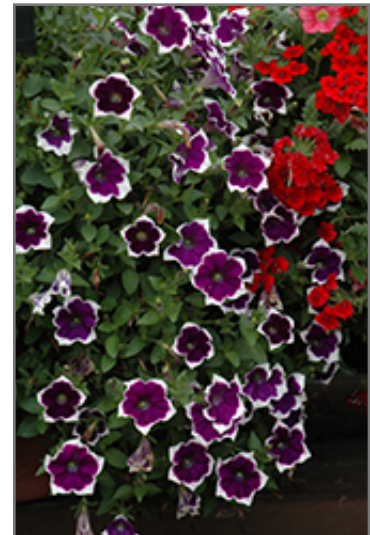
Cascadias Rim Violet Petunia flowers