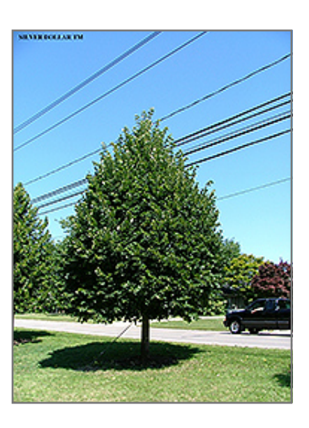
Silver Dollars Linden