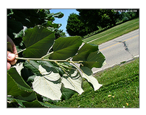
Silver Dollars Linden foliage