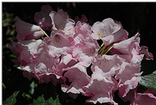
Silverleaf Rhododendron flowers