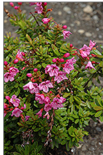
Coppelia Phylliopsis flowers

Coppelia Phylliopsis is recommended for the following landscape applications;