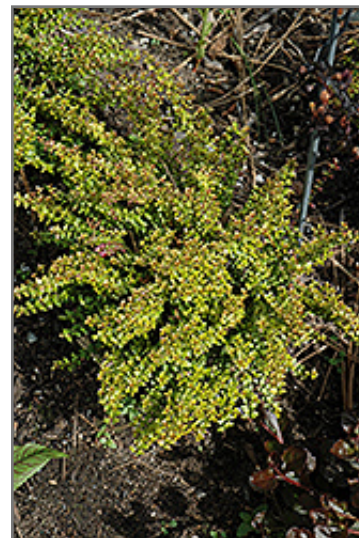
Twiggy Box Honeysuckle