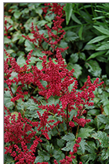
Burgundy Red Astilbe flowers

Soft, showy, red plumes, deepen to burgundy as they age; flowers rising above glossy leaves; perfect in a shady spot with dappled light; prefers moisture so water regularly for abundant flowers and nice foliage