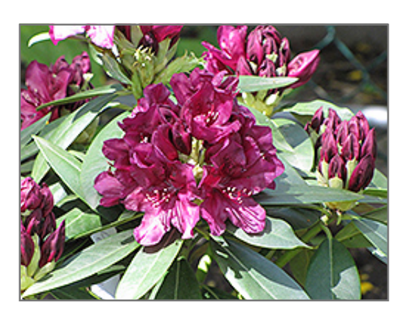
Polar Night Rhododendron flowers

Polar Night Rhododendron will grow to be about 3 feet tall at maturity, with a spread of 5 feet. It tends to be a little leggy, with a typical clearance of 1 foot from the ground. It grows at a slow rate, and under ideal conditions can be expected to live for 40 years or more.