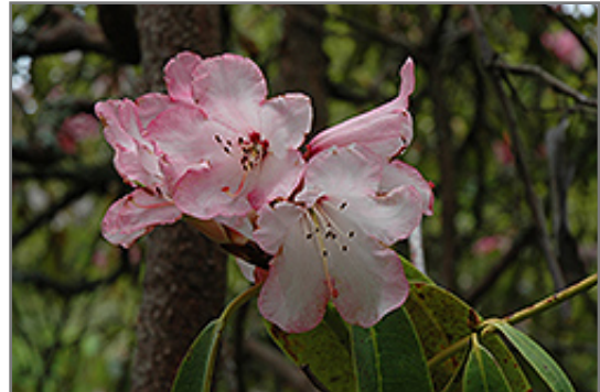
Roseum Fortune Rhododendron flowers