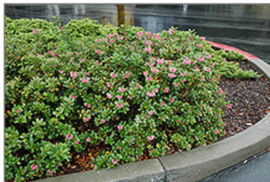
Newport Dwarf Escallonia in bloom