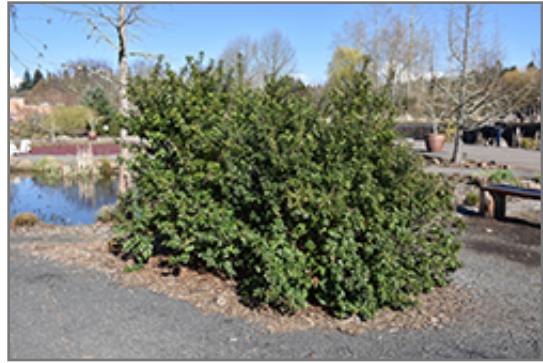
Red Escallonia

This shrub does best in full sun to partial shade. It does best in average to evenly moist conditions, but will not tolerate standing water. It is not particular as to soil type or pH, and is able to handle environmental salt. It is somewhat tolerant of urban pollution. This species is not originally from North America.