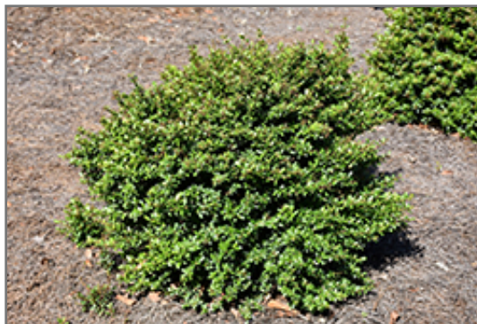
Whorled Class Viburnum

This shrub does best in full sun to partial shade. It is very adaptable to both dry and moist locations, and should do just fine under average home landscape conditions. It is not particular as to soil type or pH. It is highly tolerant of urban pollution and will even thrive in inner city environments. This is a selected variety of a species not originally from North America.