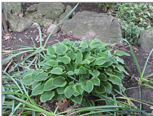
Hope Hosta

Hope Hosta is recommended for the following landscape applications;