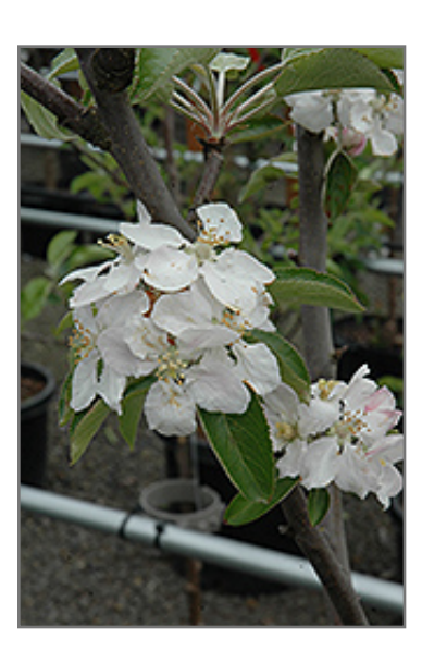
Spitzenburg Apple flowers