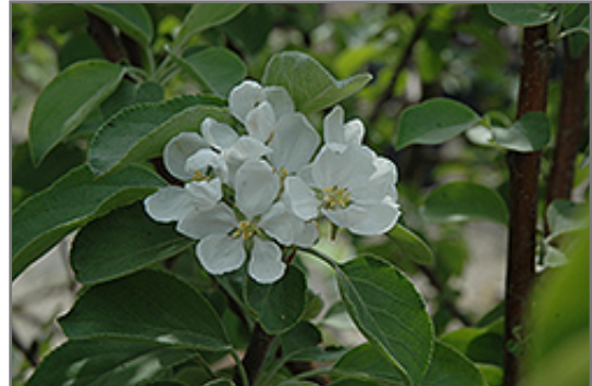
Prairie Sun Apple flowers

Aside from its primary use as an edible, Prairie Sun Apple is suitable for the following landscape applications;