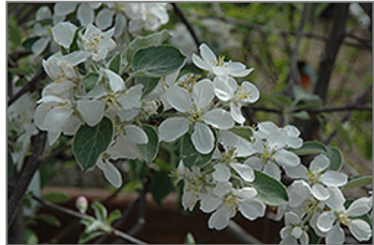
Dexter Jackson Dwarf Apple flowers