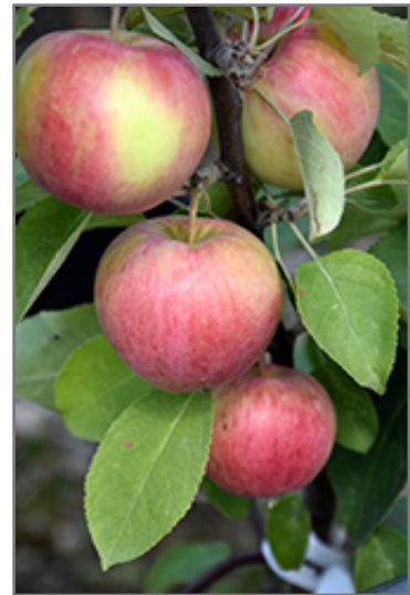
Dexter Jackson Dwarf Apple fruit

Dexter Jackson Dwarf Apple is clothed in stunning clusters of fragrant white flowers along the branches in early spring before the leaves. It has dark green deciduous foliage. The pointy leaves turn yellow in fall. The fruits are showy gold apples with a red blush, which are carried in abundance from late summer to mid fall. The fruit can be messy if allowed to drop on the lawn or walkways, and may require occasional clean-up.