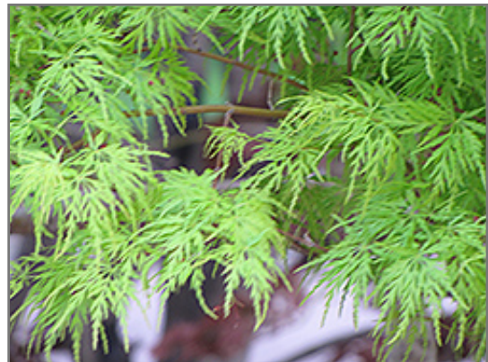
Kiri Nishiki Japanese Maple foliage