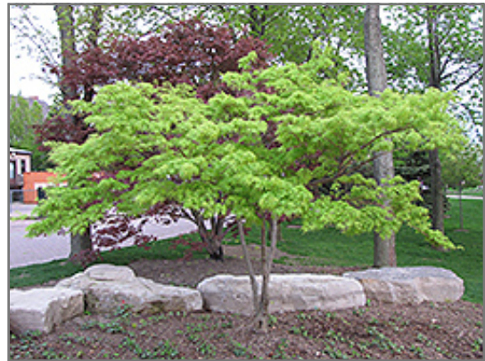
Kiri Nishiki Japanese Maple

Kiri Nishiki Japanese Maple is recommended for the following landscape applications;