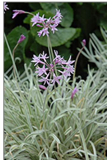
Tricolor Variegated Society Garlic flowers

Aside from its primary use as an edible, Tricolor Variegated Society Garlic is suitable for the following landscape applications;