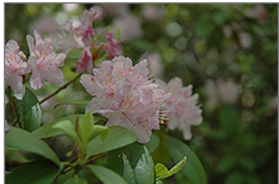
Windbeam Rhododendron flowers