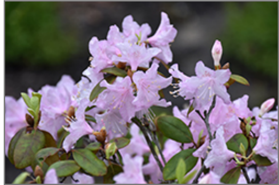
Windbeam Rhododendron flowers