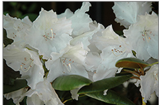
Trinity Rhododendron flowers

A showy broadleaf evergreen rhododendron producing angelic white flowers with very light green dorsal spotting; an excellent border shrub that is best with some shelter, absolutely must have well-drained, highly acidic and organic soil