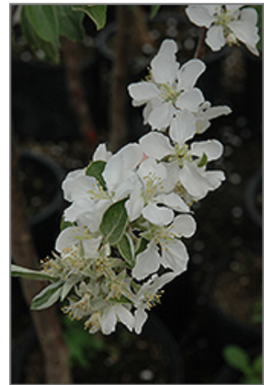
Carlos Queen Apple flowers