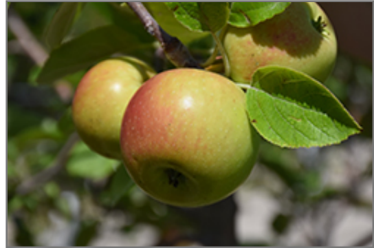
Carlos Queen Apple fruit

Carlos Queen Apple features showy clusters of lightly-scented white flowers along the branches in mid spring, which emerge from distinctive red flower buds. It has forest green deciduous foliage. The pointy leaves turn yellow in fall. The fruits are showy green apples with a red blush, which are carried in abundance from late summer to early fall. The fruit can be messy if allowed to drop on the lawn or walkways, and may require occasional clean-up.