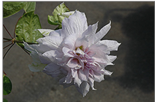
Belle of Woking Clematis flowers