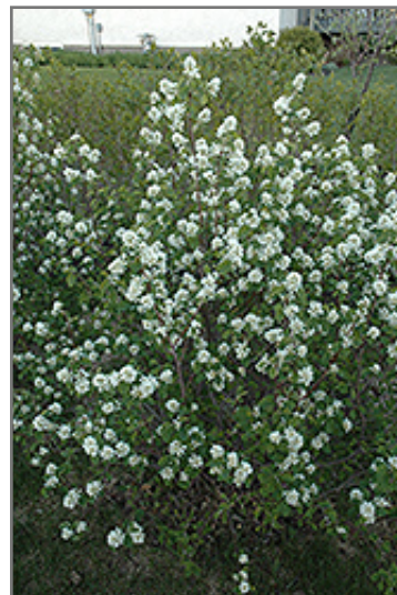
Northline Saskatoon in bloom

Northline Saskatoon is covered in stunning clusters of white flowers rising above the foliage from early to mid spring before the leaves. It has dark green deciduous foliage. The oval leaves turn an outstanding yellow in the fall. It features an abundance of magnificent blue berries in late spring.