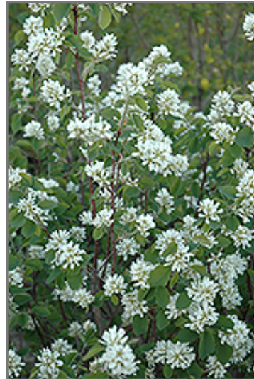
Northline Saskatoon flowers