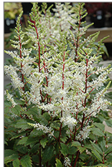
Rock And Roll Astilbe flowers