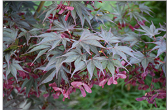
Red Dawn Full Moon Maple foliage