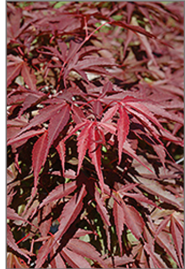
Red Dawn Full Moon Maple foliage