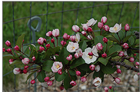
Spring Sensation Flowering Crab flowers