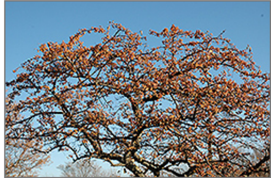
Spring Sensation Flowering Crab fruit